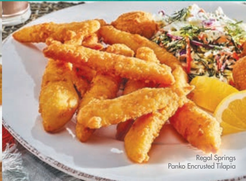
Regal Springs Panko Encrusted Tilapia