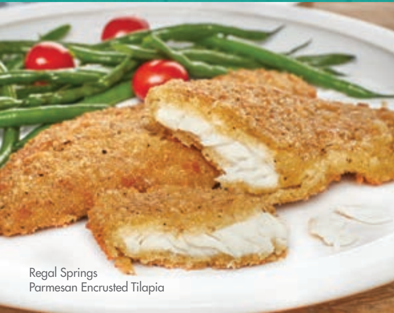
Regal Springs Parmesan Encrusted Tilapia